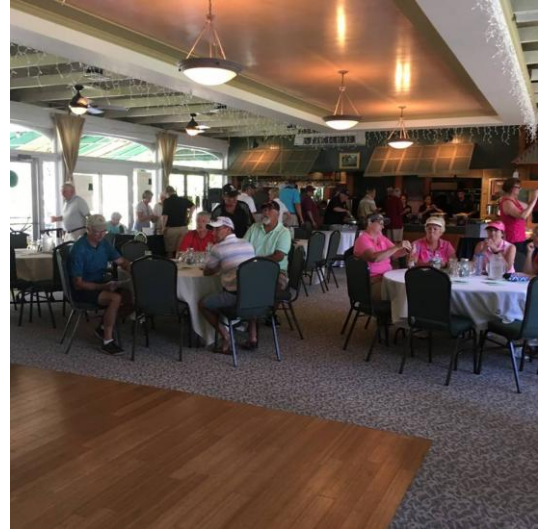
We had 67 golfers join us this year

The Association is proud to announce that since 2000, $108,000 has been awarded to RHS seniors by the Association through the proceeds of the annual golf outing. The Association extends its thanks and appreciation to ALL those who contributed to the success of the outing this year in any way—you are all on a winning team!